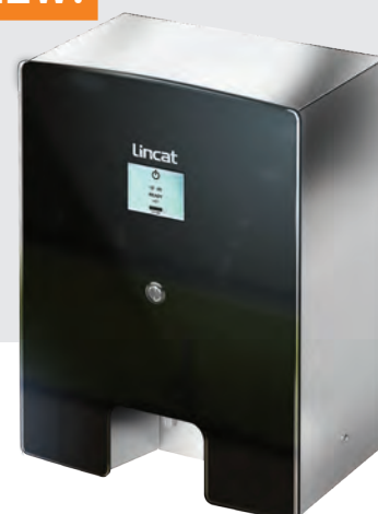
WMB5FX/PB Wall Mounted Automatic Boiler with Touch Screen Control and Push Button Dispense