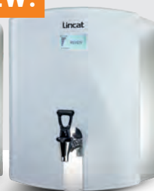
WMB3F FilterFlow wall mounted automatic water boiler